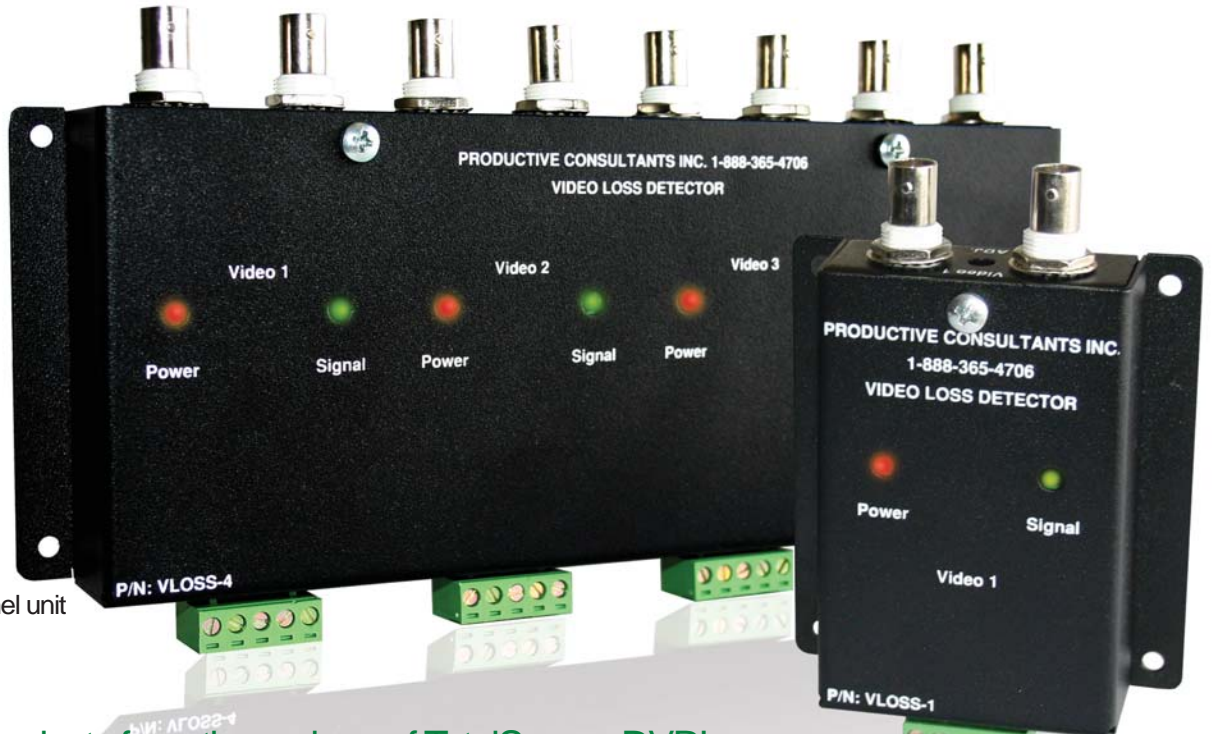
Four channel unit (VLOSS-4)

Single channel or four channel stand alone video loss detectors with relay outputs